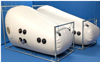
Single person Shoe Chamber: Std. or Long